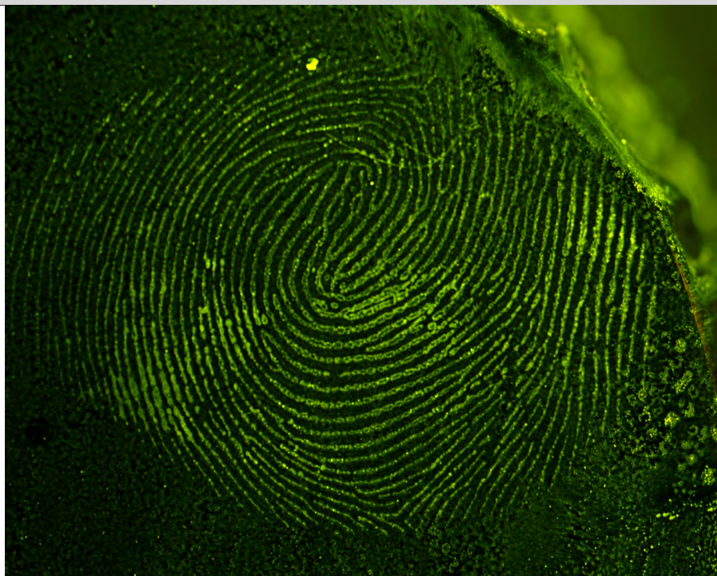
Whorl pattern on right thumb, including some enclosures and dots. Processed with cyanoacrylate and RAM dye, photographed with 515 nm light through orange filter.